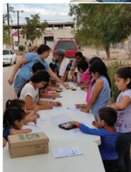
Above: Worshipping God with the kids. Left: Coloring a Bible story picture and memorizing a Bible verse.

that a brick-and-mortar church can be established in that neighborhood to continue this beautiful children's ministry.